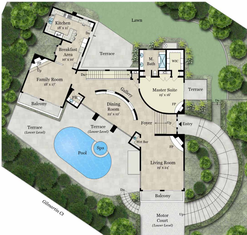
MAIN LEVEL 2,615 SQ FT